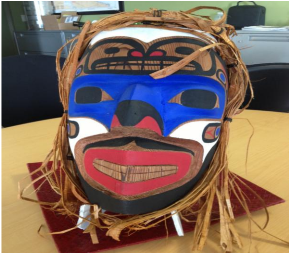
First Nations mask donated by Marine Harvest